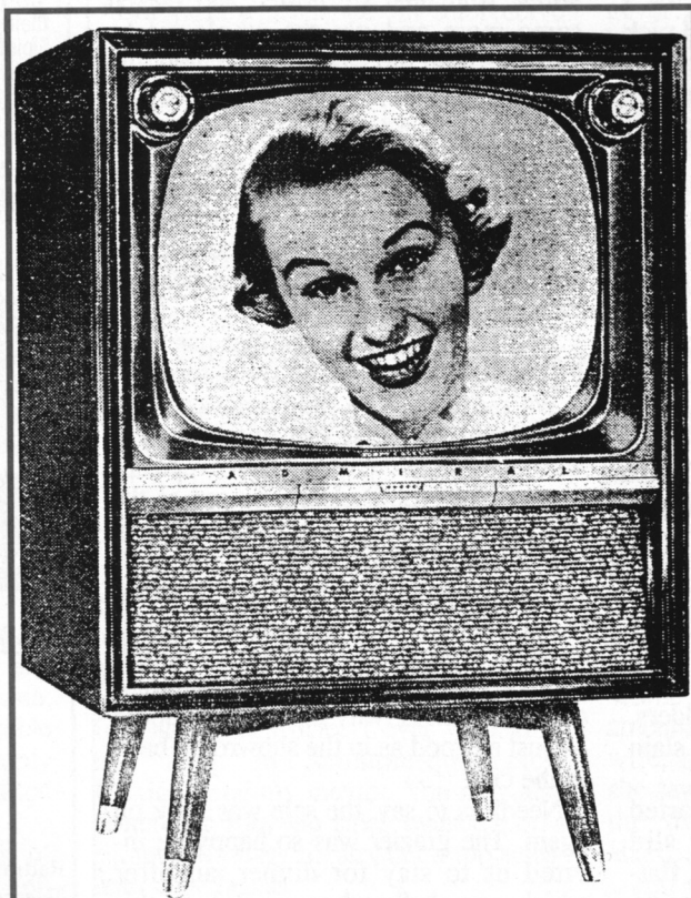
The only illustration we could find of one of the original Admiral TV receivers is this one from the September 1956 'House & Garden', of a 'Miami' model. Described as an attractive TV console, it had a swivel base and cost 229 guineas. The minor controls were behind a drop-down aluminium panel below the screen.

The one questionable aspect of the design was in the sound